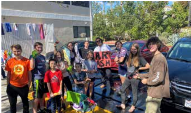
USYers hold their first annual Car Wash