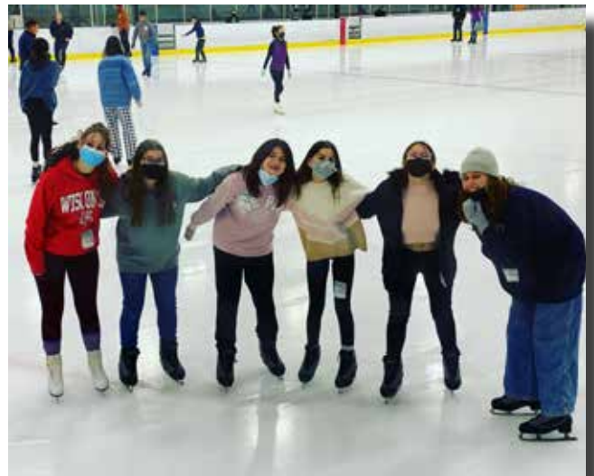
Ice Skating with USY