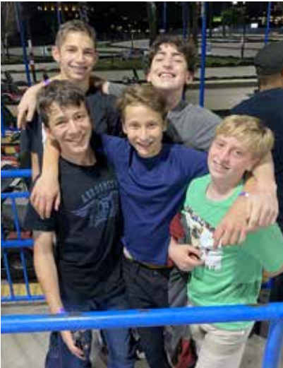
Saturday Night at Boomers with USY