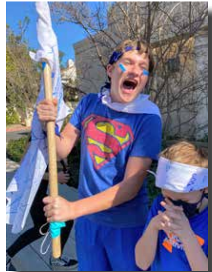
The Olympics were highly competitive for the Machar Kadimaniks!