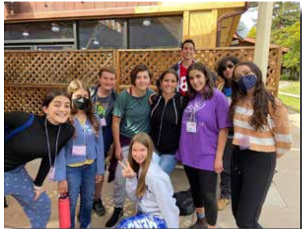
Far West USY Fairytale Campment weekend Shabbaton at Camp Ramah