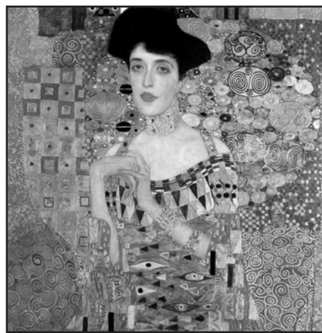
"Woman in Gold" by Gustav Klimt