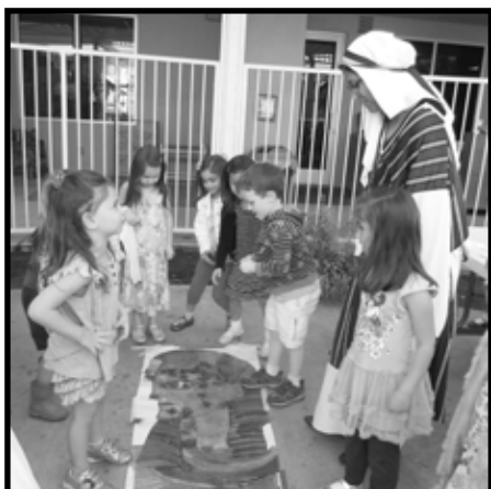
The plague of frogs. Children threw frogs on the Pharaoh.

Check our website at http://www.cbi18.org