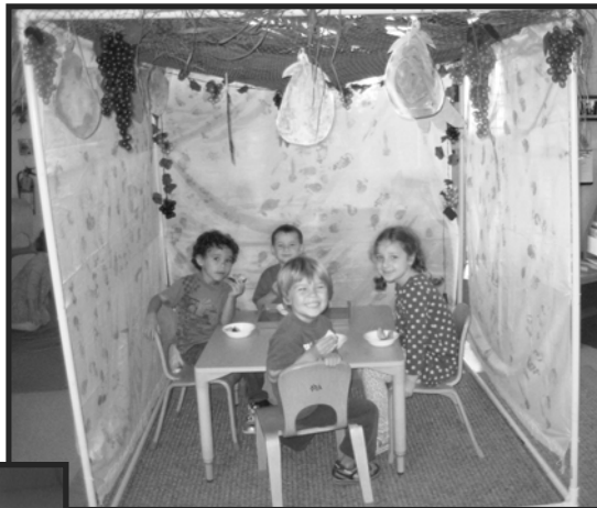
Enjoying lunch in the sukkah.