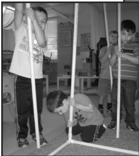
Building the sukkah.