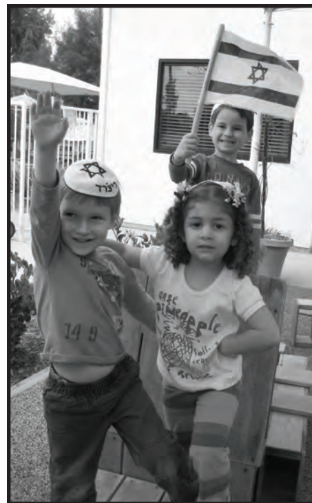
The "Israel" Connection.

We work hard to stay connected to Israel all year long. The older children Skype or write notes and draw pictures to families and friends in Israel. We plant trees, flowers, seeds and vegetables on Tu B'Shevat and with each seasonal change. We have animals inside our classrooms and in the outdoor environment we have feeders for