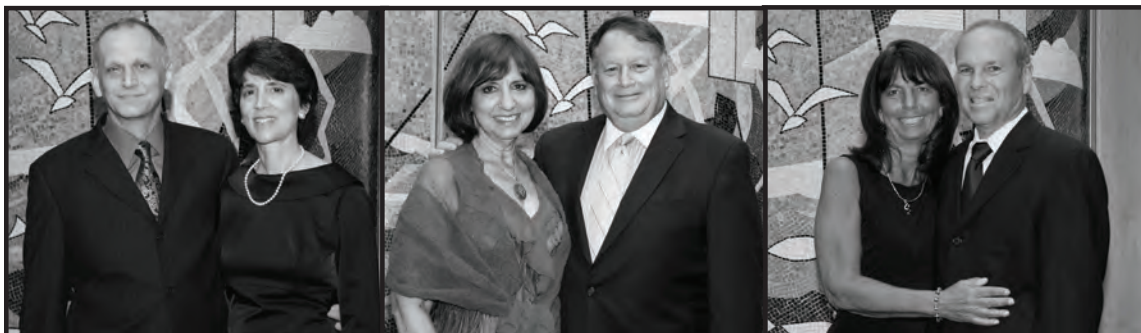
Our Gala Honorees

and guests of CBI that they felt the warmth and friendliness of our members during their visit. The CBI booth at the Israel Expo is another opportunity to showcase our synagogue, its programs, and its people. ☆